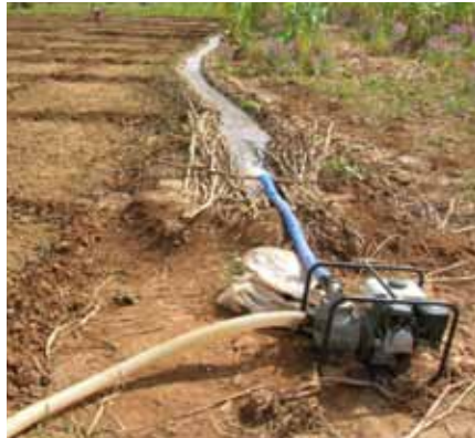
Figure 7: Small mopump suitable for 2.5 ha of irrigated area

The small low-lift motorized pumps driven by small petrol or diesel engines (Figure 7) with a capacity of 2 to 5 horsepower (hp) and a typical discharge of 2–15 L/second have proved cost-effective. The price of this centrifugal pump has substantially decreased as the result of imports from China and India, and is typically between US$200 and US$500, which more established small-scale farmers can afford, and allows them to irrigate a substantial area of 1 to 5 ha. The operational costs are mainly fuel costs, which are estimated at US$500/ha per season.