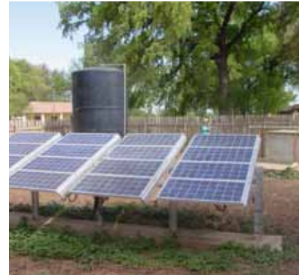
Figure 8: Solar panels, pump and reservoir for drinking water and garden irrigation

The solar pump unit (Figure 8) includes solar panels, a battery pack with current regulator unit for energy storage, and an electric motor linked to the water pump. To irrigate effectively, water needs to be stored in a water reservoir or tank and connected to a low-pressure pipe system or drip system.