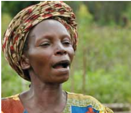
Figure 26: A farmer participates in farmer field school training

D emonstrations and training need to be included in the DRR/M programme and are most effective if implemented over an extended period, spanning a full agricultural calendar, for example, and in groups where farmers have ample opportunity to assess the benefits of the new technologies jointly. Training in groups builds on existing knowledge and experience, and strengthens cooperation among farmers in the use of the equipment and in the sustainable management of water resources. A participatory planning from problem analysis to solution identification is a successful approach.