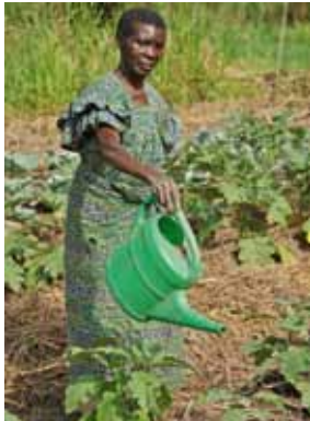
Figure 1: Vegetable irrigation by watering can