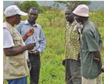
Figure 27: Extension staff in farmer field school

Training of the technical staff is crucial to the whole process. Prior to the farmer training, support staff – both technical irrigation staff as well as field extension workers – receive intensive technical training as well as detailed instructions on the procedures for the farmer training. Training of technical staff is carried out for each season with in-service training and an intensive reporting system during the implementation of the farmer training allows for close monitoring and evaluation of the results.