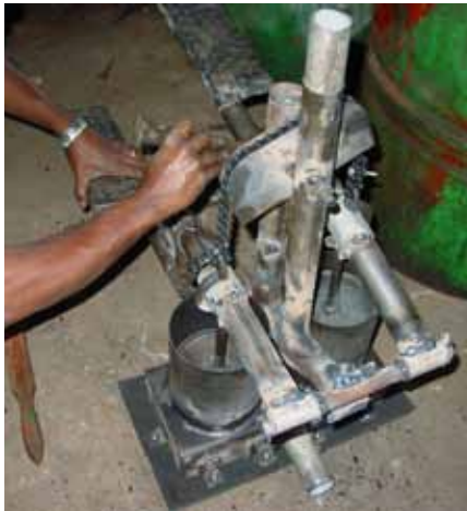
Figure 28: Manufacturing a metal treadle pump

Finally, international aid programmes (e.g. FAO SPFS), often in close cooperation with specialized NGOs, have been successful in establishing and promoting the capacity of small private companies to manufacture irrigation equipment (treadle pumps, Figure 28); to design and install irrigation equipment; as well to train local teams for well development. They also link the government stakeholders and private sector to such initiatives to ensure sustainability and long-term gain for the participating farmers.